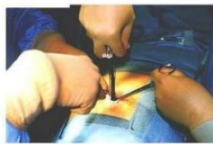
First trocar insertion