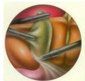
Dissection of gall bladder