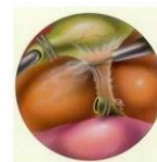
Dissection of the gall bladder from its bed