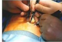
Subumbilical skin incision