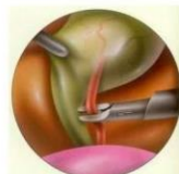
Clipping the cystic artery