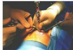
Veress needle for insufflation